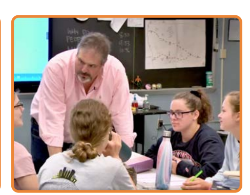
Go inside real classrooms to see trauma-informed practices in action.

To preview videos, please visit: www.traumainformedonlineacademy.com